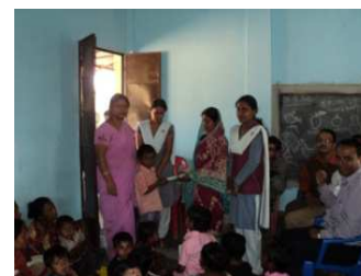
Books distribution among children