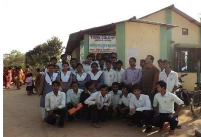
NSS volunteers at the Adopted Village -Town Colony

18. NSS Adopted Village: Town Colony, Gakulpur, Udaipur, Tripura is the adopted village of the NSS unit of the college. This is a small village, around 5 k.m. away from the college. This is a hilly place and surrounded by rubber plantation. The population of the village is about 500 (male - 270, female - 230, between (1-5) years - 40, more than 60 years - 12). There are 103 families which are all almost socio-economically poor. There is no government service holder in this village. However only 15 numbers family have BPL card holder. In this village about 25 numbers of adult person cannot write their own name.