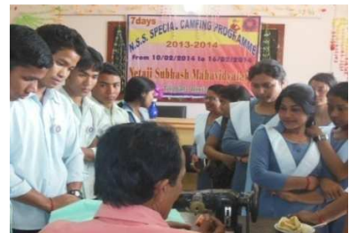
Photo: Workshop on Embroider Training