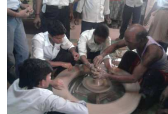
Photo: Workshop on Terracotta

In the afternoon session, organized open quiz contest among NSS volunteers on Swami Vivekananda in the college premises.