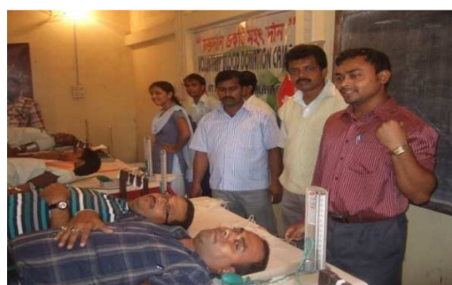
Photo: Students-teachers of NSM donating blood

18. NSS Adopted Village: Town Colony, Gakulpur, Udaipur, Tripura is the adopted village of the NSS unit of the college. This is a small village, around 5 k.m. away from the college. This is a hilly place and surrounded by rubber plantation. The population of the village is about 500 (male - 270, female - 230, between (1-5) years - 40, more than 60 years - 12). There are 103 families which are all almost socio-economically poor. There is no government service holder in this village. However only 15 numbers family have BPL card holder. In this village about 25 numbers of adult person cannot write their own name.